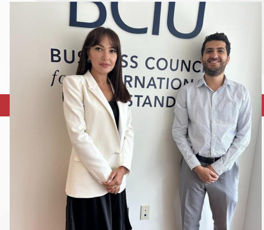
BUSINESS COUNCIL FOR INTERNATIONAL UNDERSTANDING