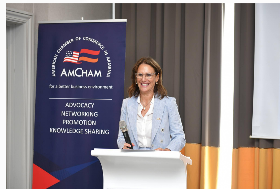
Sarah Morgenthau - Special Representative of the U.S. Department of State